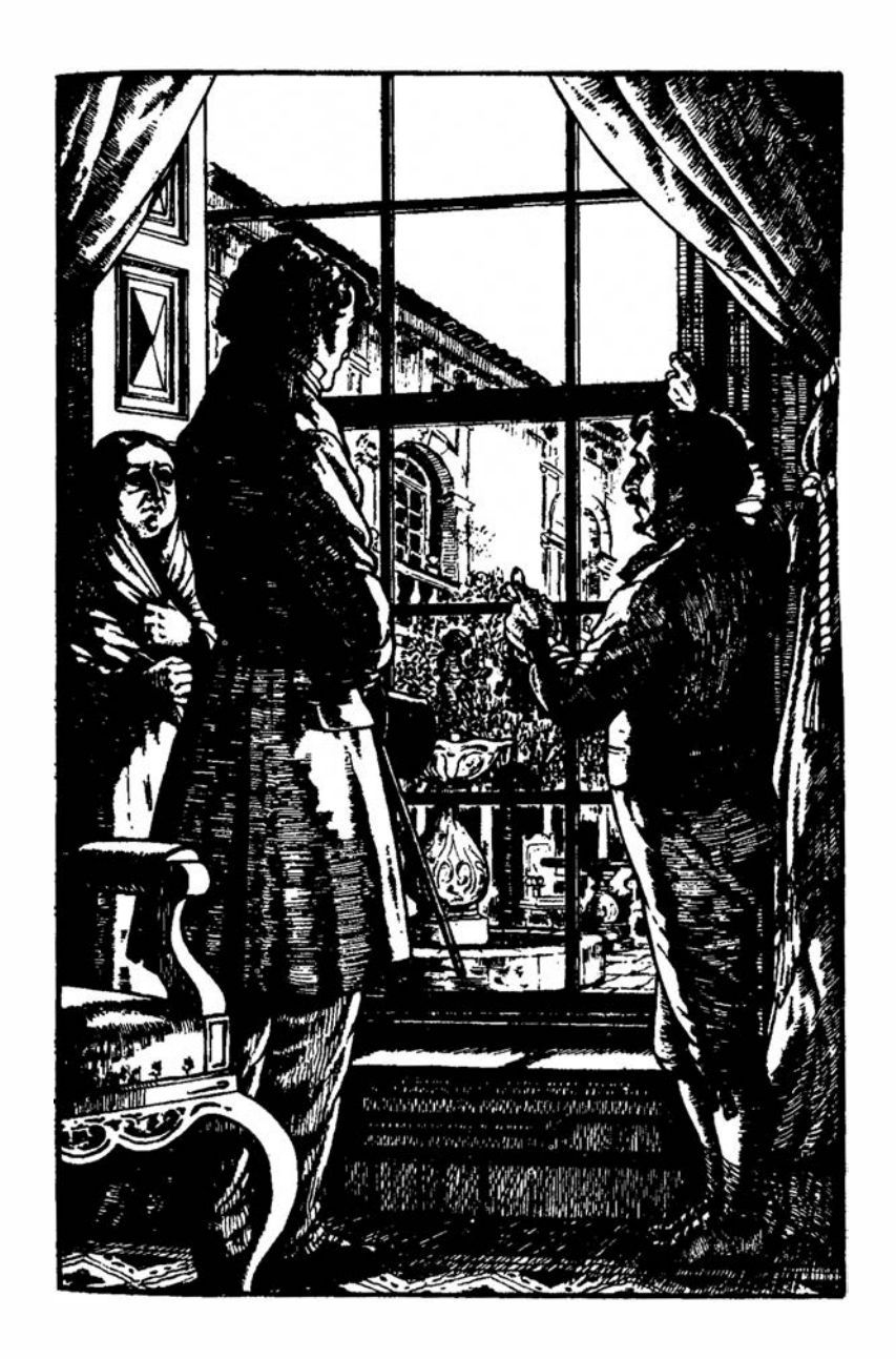
Outside, there was a little courtyard.