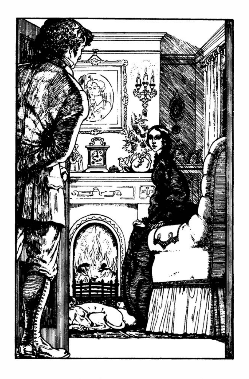
'Now at last, 1 was face to face with my cousin Rachel.'