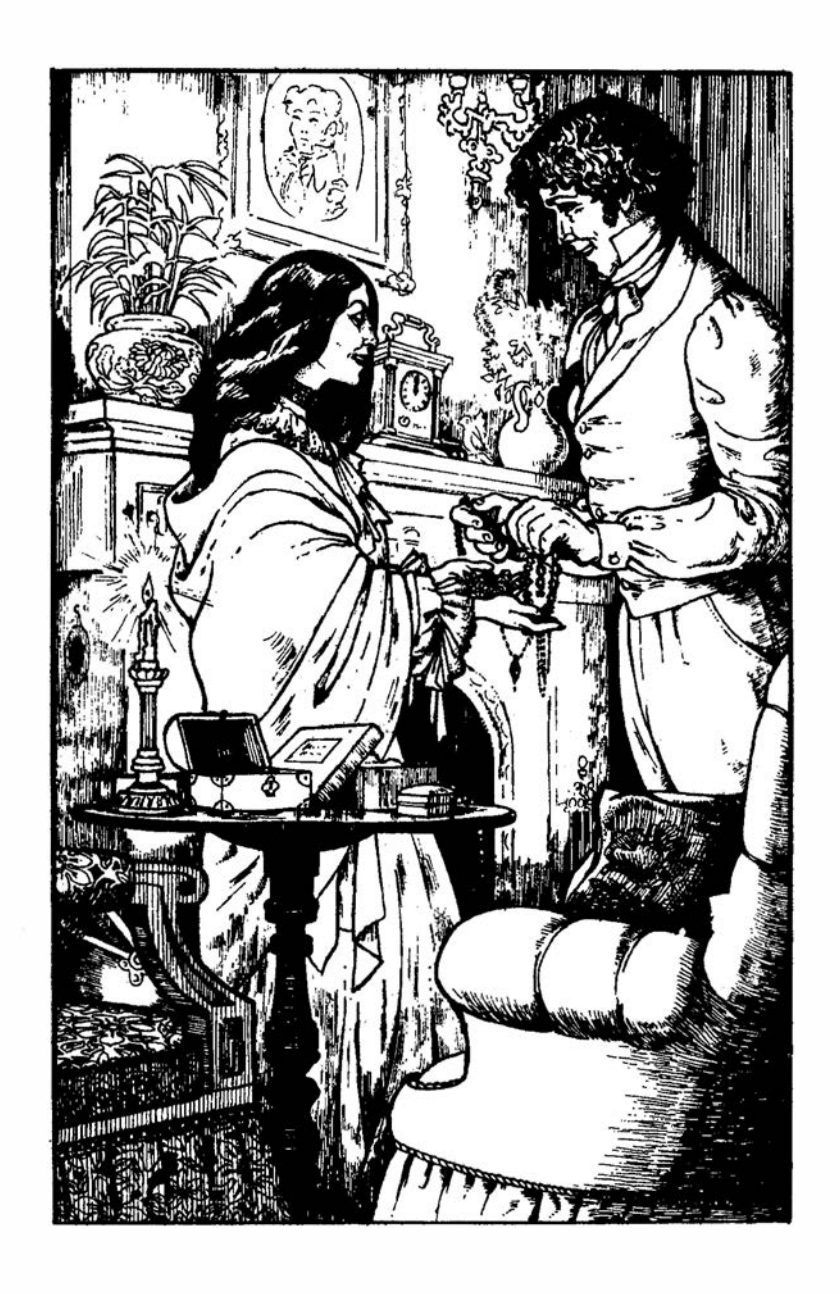
I put the document on her table and began to open the boxes of jewels.